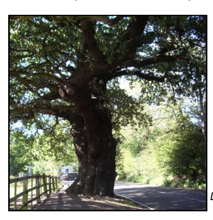
"The Dickens Oak" Vicarage Lane, Chigwell.

The large oak trees are remnants of the hedgerows which used to mark out the old field boundaries. The large fields created by removing hedges make farming more efficient but at the expense of the landscape and wildlife.