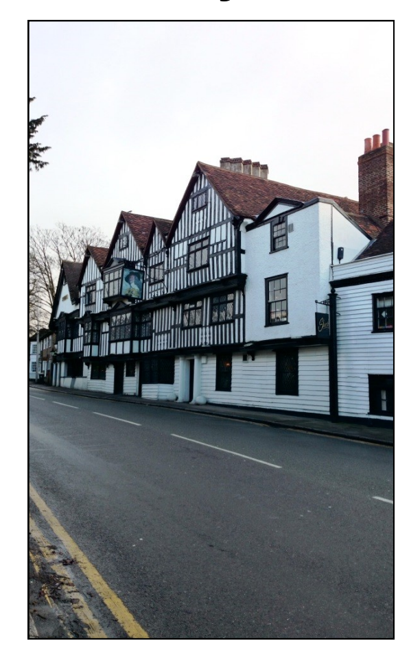
The Old Kings Head