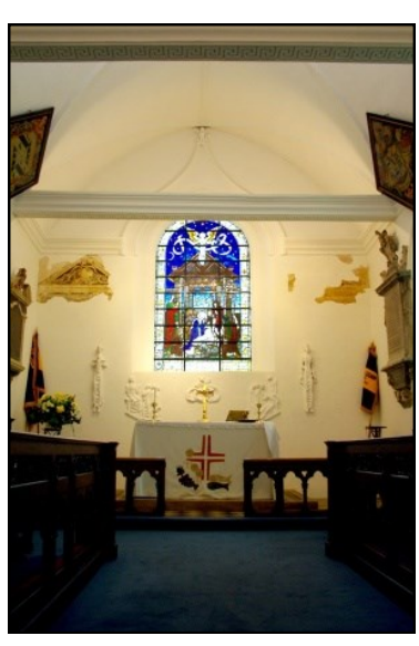
St Mary's and All Saints Church

St Mary's and All Saints Church was the only church near Abridge until 1836. Until this time villagers had to walk three miles to get to church using footpaths as there were no direct roads.