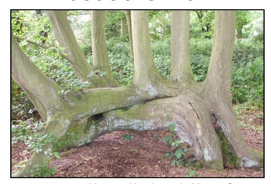
Veteran Hornbeam in Mutton Corner.

The Abridge Country Walk is approximately 3 miles around the ancient woodlands of Lambourne. Alternatively there is a longer walk which encompasses Hainault Forest. This route can be found in the Lambourne Country Walk leaflet.