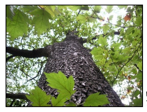
Wild Service Tree

Apes Grove is home to the Estate's only known Wild Service Tree. This species is relatively rare in Britain and is confined to pockets of Ancient Woodland. The fruit of the Wild Service Tree was traditionally used as a herbal remedy for colic, the Latin name Sorbus torminalis means "Good for colic". Before the introduction of hops the fruit was used to flavour beer. The bark of the Wild Service Tree has a chequered effect caused by the bark peeling off in places. This is one of the theories as to where the pubs with the name Chequers comes from.